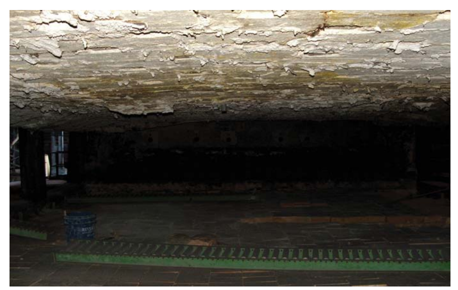
Fig. 1. Picture of old roof

The No. 4 Furnace was built in 1914 and has seen many different refractory linings over the years. The old furnace roof